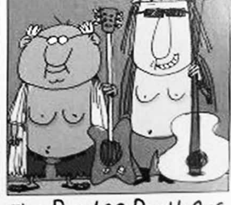
The Boobie Brothers