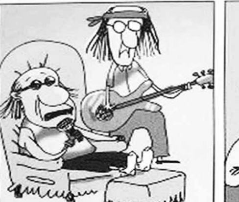
The Grateful we're not Dead