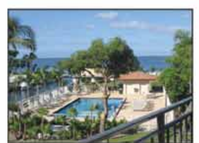
TAMARIND BAY - FOR SALE AND RENT - nice views and sunsets from the fully furnished unit. Gated entrance. Protected canal deepwater dockage, 2 pools, tennis and boat ramp.