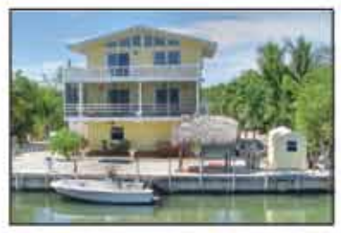
HIGH END EXECUTIVE STYLE HOME IN STILLWRIGHT POINT - 3/3 plus garage on canal with direct access to the bayfront. Room for a large family.