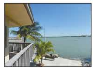
BAYFRONT HOME FOR RENT - available June 15th, annual basis. Private location. 3 bedroom, good dockage. Furnished.