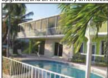
PORT LARGO POOL HOME - short sale - magnificent 4 bedroom home 3 baths Gourmet kitchen. Travertine floors, many upgrades and custom details. Very spacious. Call Jane or Wendy.

SALE OR RENT - exquisite large property with 180' dockage; bay views from every room; 9 bedrooms. Large in-ground pool, outdoor kitchen, upgrades, and all the luxury amenities!!