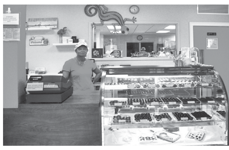
Check it out! Key Largo Chocolates - something for everyone.