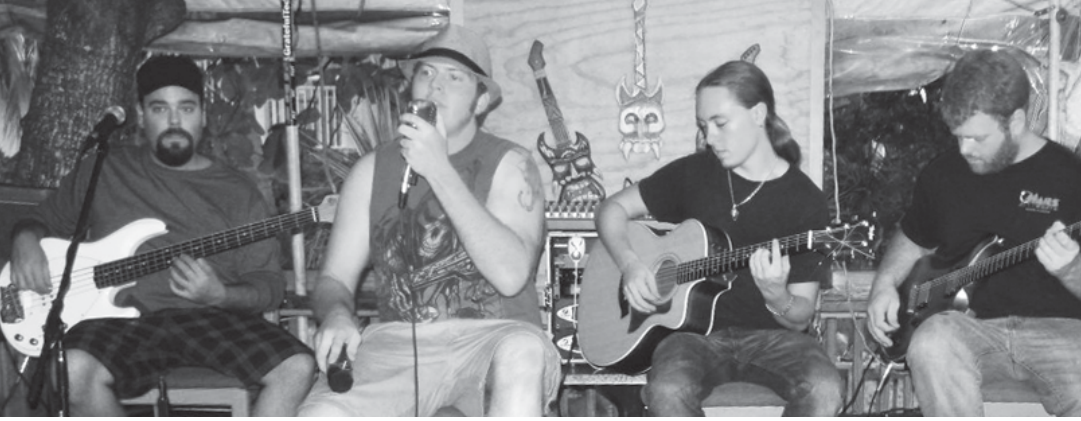
Colbert the Band at Sharkey's Pub