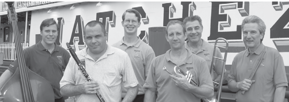
The Dukes of Dixieland