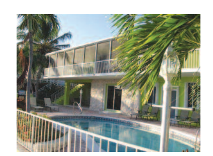
PORT LARGO POOL HOME - short sale - magnificent 4 bedroom home 3 baths Gourmet kitchen. Travertine floors, many upgrades and custom details. Very spacious. Call Jane or Wendy