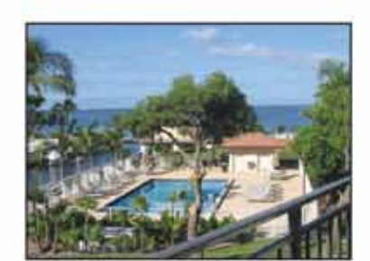
TAMARIND BAY - FOR SALE AND RENT - nice views and sunsets from the fully furnished unit. Gated entrance. Protected canal deepwater dockage, 2 pools, tennis and boat ramp.