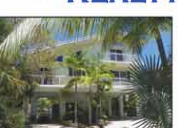
FOR RENT - LARGE 3/2 CANALFRONT - available immediately. Fully furnished and ready for all your summer fun. Located bayside on Blackwater Sound.