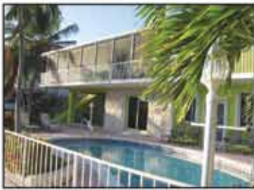
PORT LARGO POOL HOME - short sale - magnificent 4 bedroom home 3 baths Gourmet kitchen. Travertine floors, many upgrades and custom details. Very spacious. Call Jane or Wendy.