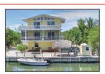
HIGH END EXECUTIVE STYLE HOME IN STILLWRIGHT POINT - 3/3 plus garage on canal with direct access to the bayfront. Room for a large family.

SALE OR RENT - exquisite large property with 180 feet of dockage, and bay views from every room. Nine bedrooms. Large in-ground pool, outdoor kitchen, upgrades, and all the amenities one expects in a luxury home!!