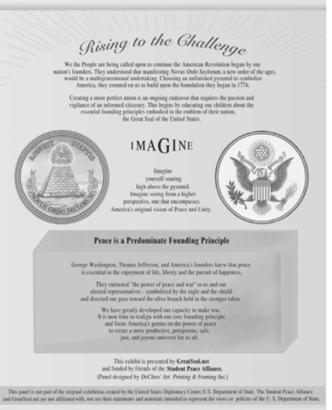
The new twelfth panel ("Rising to the Challenge") highlighting peace.