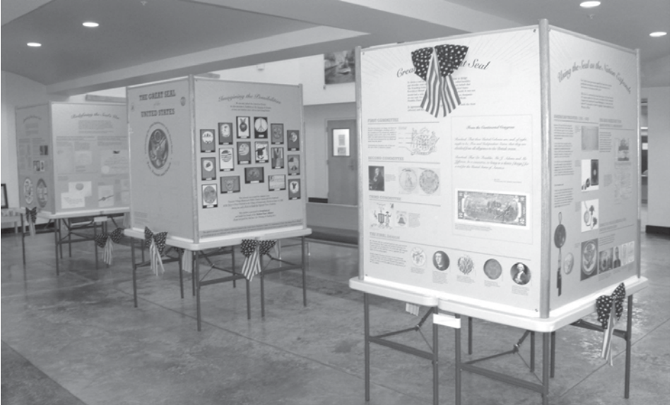
The 12-panel exhibit is currently on display at the Murray Nelson Cultural and Government Center.

ing the founders' vision that America is an ongoing and enduring endeavor to create a more perfect union. We believe that this U.S. Great Seal educational project will help unite a divided nation by enriching a nonpartisan national discussion about who we are as a people in relation to the original American Dream envisioned by our founders and embodied in the Great Seal of the United States they designed. Symbols have a powerful unifying effect. As Joseph Campbell believed: "The next great step for the human family will be to recognize, in our daily lives, the unity that already exists. And a necessary step is the recognition of the common symbols of this unity."