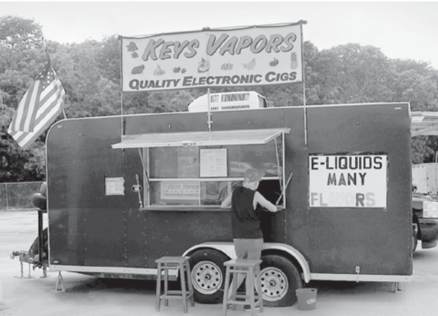
Stop by Keys Vapors at MM 101 today!

Don't smoke your life away! Stop by Keys Vapors and see Howie or AJ. 305-731-5118