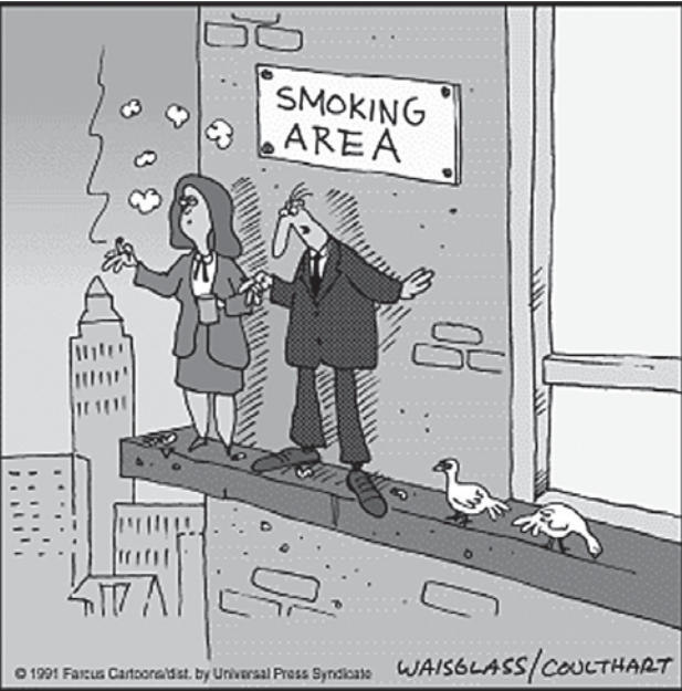
"That's the third smoker we've lost this week."

As of this writing I am on day 16 cigarette free and I haven't missed