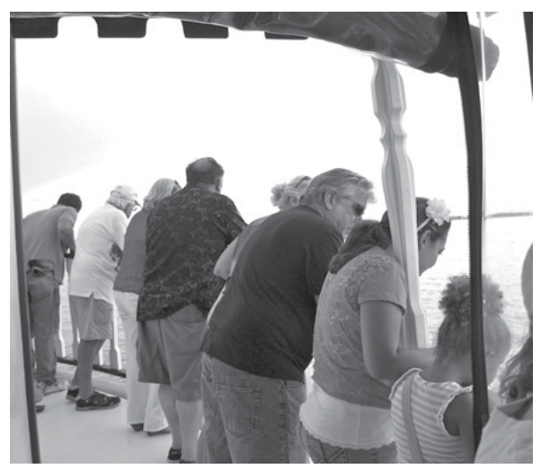
Dolphin sighting on the Island Time Cruise.