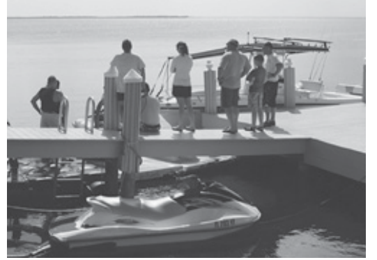
Renting a boat or waverunner is so easy - stop by Keys Adventure at Gilbert's or The Big Chill.