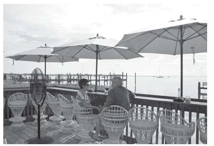
Snook's Bayside is a very romantic place to take a date.

Many familiar faces: Pirates on the Water party at Denny's.