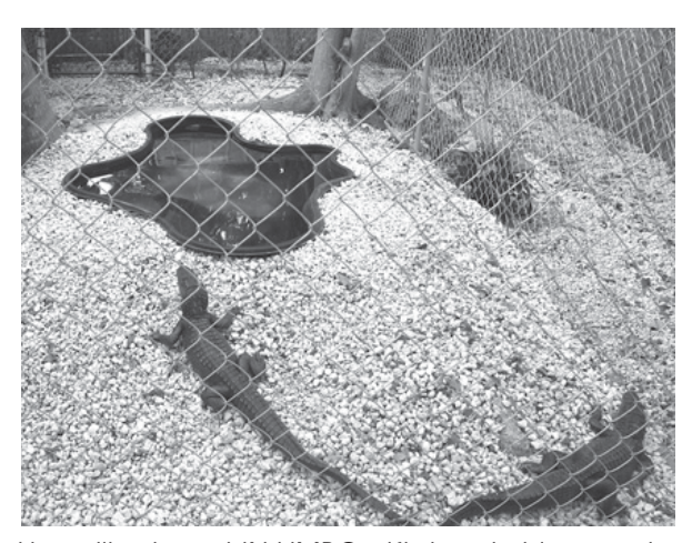
Live alligators at IN LIMBO gift shop in Islamorada.