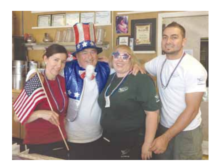
Doc's Diner - MM 99 bayside, Downhome country cooking and super-friendly, happy servers. The homemade potato casserole is to die for. Their slogan is "Come Hungry". They will feed you well.