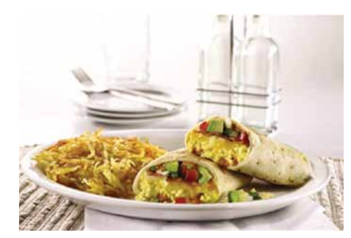
Denny's - MM 97.6 median. This is NOT your average Denny's. It has quickly become a locals favorite since it opened. It is clean as a whistle, open from 7 am to 2 am serving their famous breakfast all day long. This Denny's has a full bar with a flat screen TV. Friendly and happy servers welcome you. Locally owned and operated.

Local brunch menus often offer a complimentary mimosa or champagne with your entree, and yummy, creative seafood items are often featured.