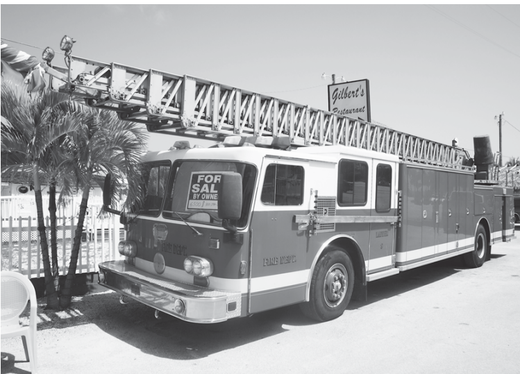
Firetruck for sale $6,500. Call Gilbert's Resort for more info 305-451-1133