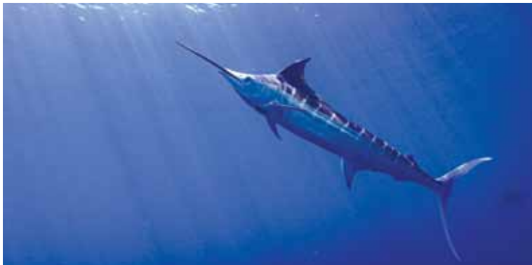
Right: This marlin showed up while Frazier was filming Oceanic White Tips in Cat Island, Bahamas in February. Frame captured from a 5k resolution Digital Cinema camera at 96 fps.

See one of Frazier's UW short movies - awesome footage he shot on Epic with Oceanic White Tip Sharks: http://youtu.be/vJAbtGz2Srs