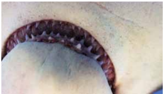
Inset: Frazier's camera angle of the hammerhead shot, a single frame captured from his Digital Cinema camera.