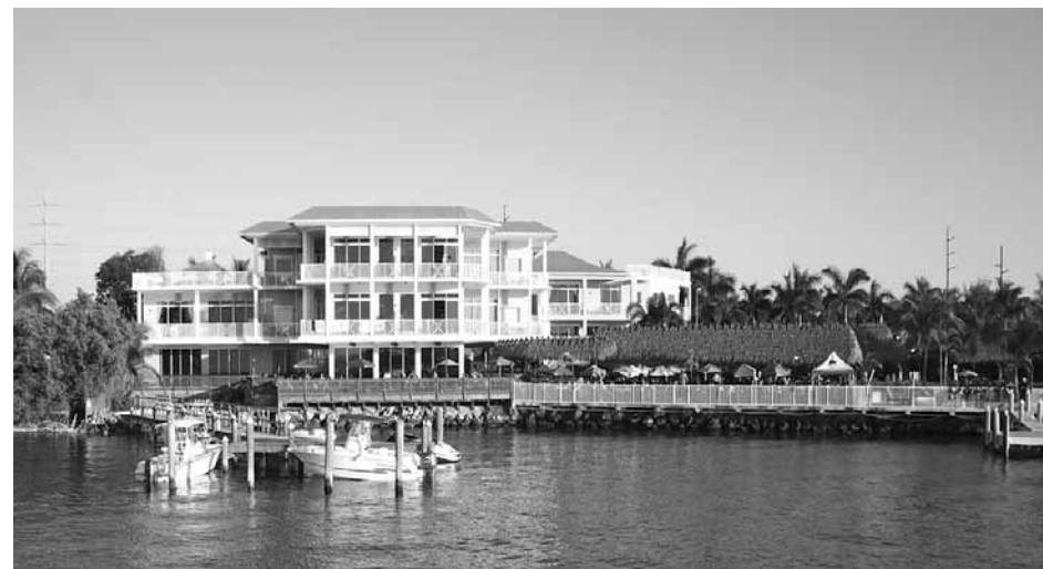
The Big Chill, viewed from the water, on a beautiful Key Largo afternoon!