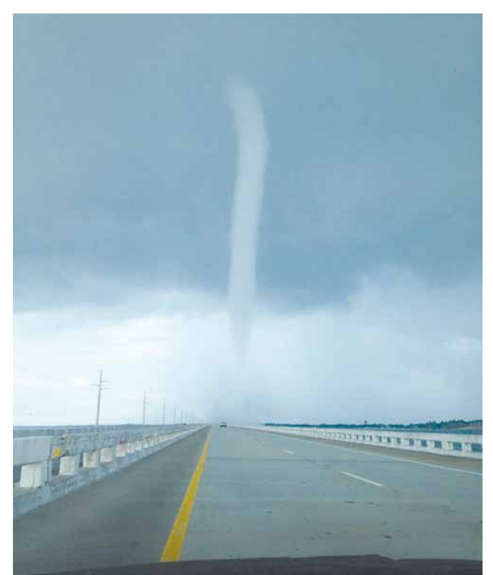
Waterspout over Bahia Honda Bridge. Photo contributed.