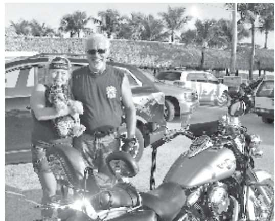
Gilbert's is the favorite destination for human and canine bikers.