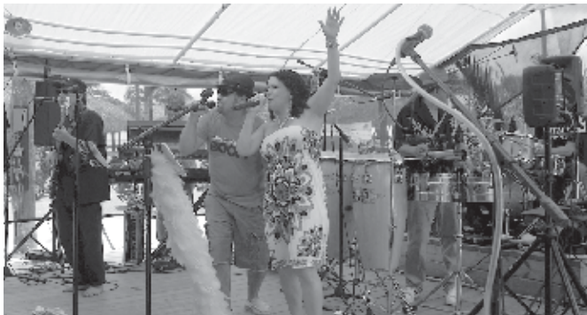
Mr. Nice Guy at Gilbert's.