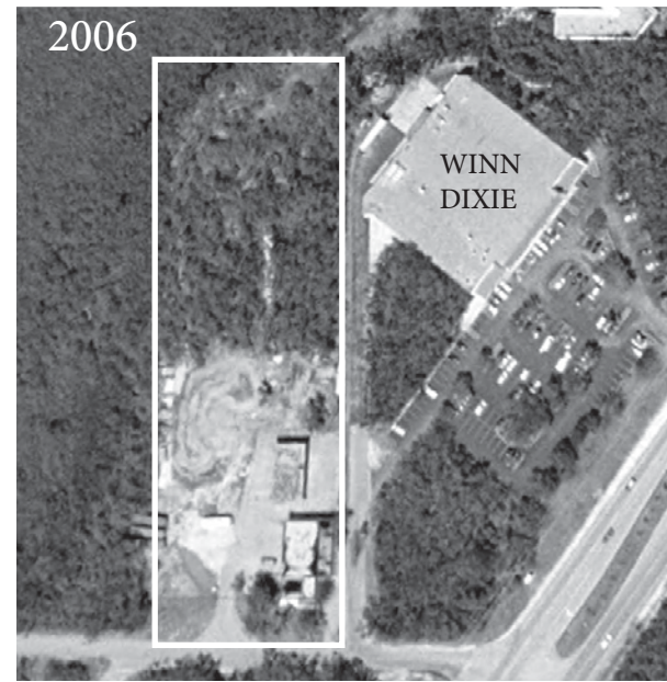
Building to the right is the Winn Dixie and behind it is the proposed site for low income housing, previously used to dump toxic trenching fill. Sometime in 2007 the land was illegally cleared.

Concerned citizens please call to request a public discussion: Townsley Schwab 305-453-8800