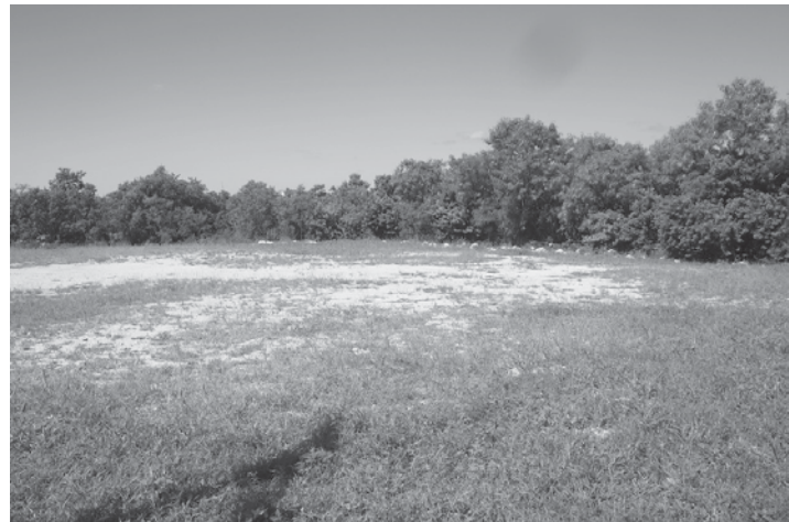
Behind the fence you can see it has been cleared.

Who would want to live on top of toxic fill? Would you want your family near it? Should these people be allowed to profit from intentionally violating County rules, that are meant to protect us, at the expense of our environment? Who will be held responsible if people become sick from living on top of or near a dump?