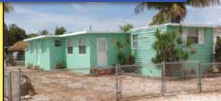
3-BEDROOM CANAL FRONT MOBILE OWNER FINANCING Fenced yard on a 60' lot. Updates to the interior. Great room for a family. Call for the financing details.