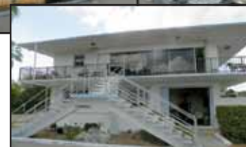
PRIVATE OCEANSIDE ESTATE HOME - Located on a very private ocean side Key Largo street. Concrete home, with a concrete roof...plus a connecting upstairs added living space. OCEAN VIEWS, and 120 feet of canal front. —DEEP WATER —DIRECT OCEAN ACCESS... downstairs apartment, and a separate workshop area. Unique! Call today!