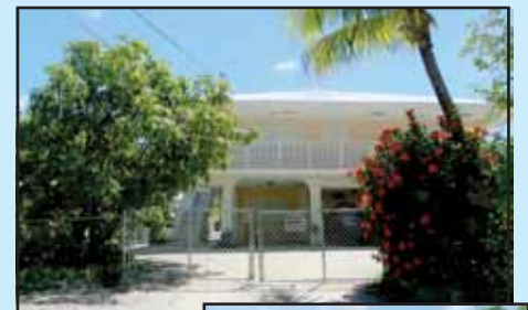
3/2 CBS CANAL FRONT HOME

Ocean side. Fenced. Clean, clear canal. Spacious living space. Open plan. Big patio overlooks canal. Will not last long!!!