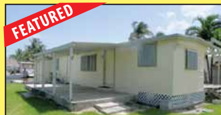
4/2 OWNER FINANCING CANALFRONT MOBILE Fenced, davits and nice seawall. Nicely furnished and ready to move into. 20% down.