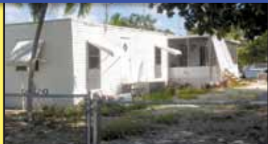
CANALFRONT MOBILE - OWNER FINANCING 2 bedrooms, fenced yard, 60 foot dock. Call for financing details. Won't last long!