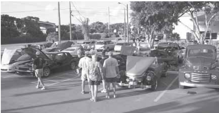
Hot Rod Car Show at Denny's.