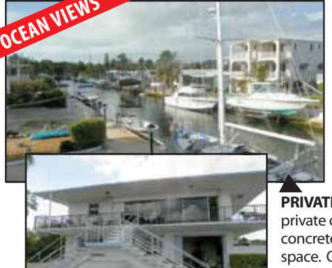
OCEAN FRONT HOME Awesome views, very private location in North Kev Largo, Great for commuters. Unfurnished. Annual Rental. Call for details

STRAIGHT OUT TO THE OCEANFRONT. Updated kitchen. 2 bdrm up and an apartment down, plus workshop. Porches on street side and canal side. Concrete roof. Beautifully landscaped. Fenced. Very close to schools... Call for an appointment.