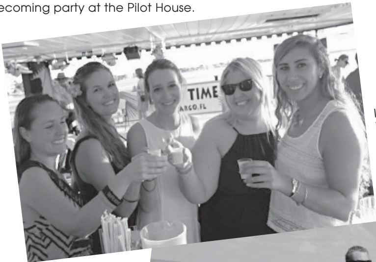
Island Time Cruise is the perfect place for a Bachelorette party or any party!