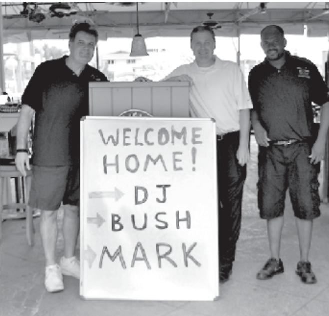
Homecoming party at the Pilot House.