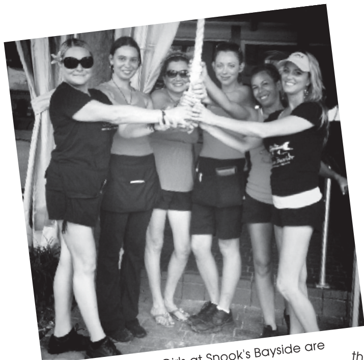
Beautiful Cabana Girls at Snook's Bayside are happy to serve you.