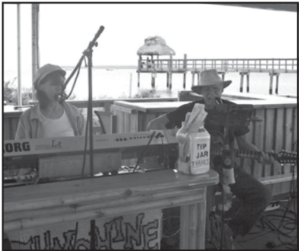
The Sunshine Band plays at the Island Grill at Mandalay.