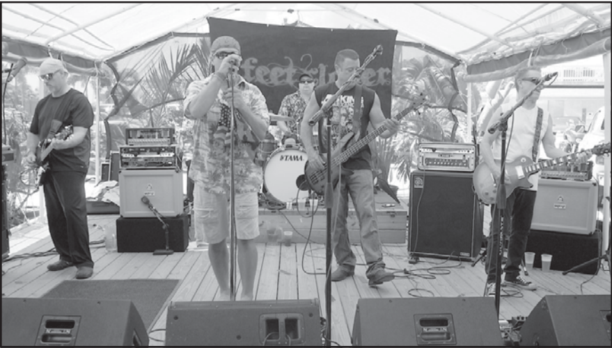
3 Feet Closer Band at Gilbert's Resort.