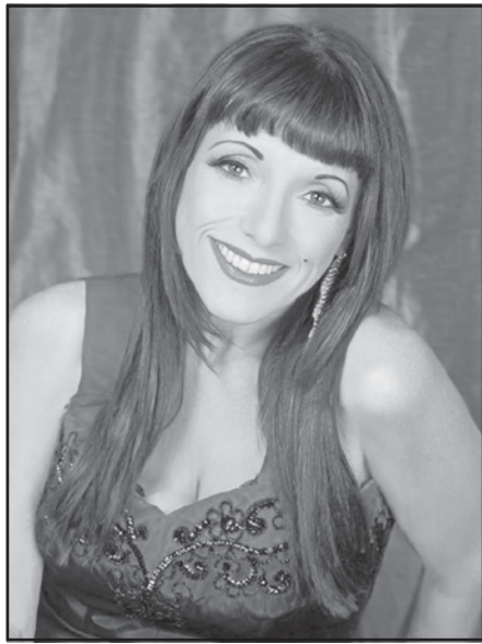
Get well Candye Kane! She had to cancel her August gig at the Bayside Grill due to illness, but she will be back.