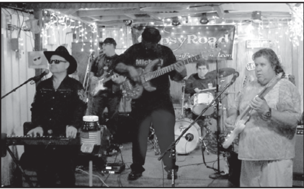
Gypsy Road Band at the Pilot House.