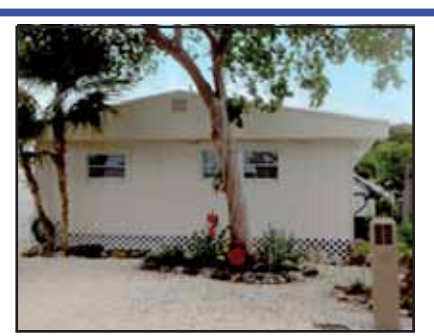
BEAUTIFUL MOBILE HOME ON A CANAL Well maintained, decorator perfect, great for full time or weekending. You won't find one nicer!! OWNER SAYS SELL!!

www.creeksidetiki.com www.facebook.com/creeksidetiki