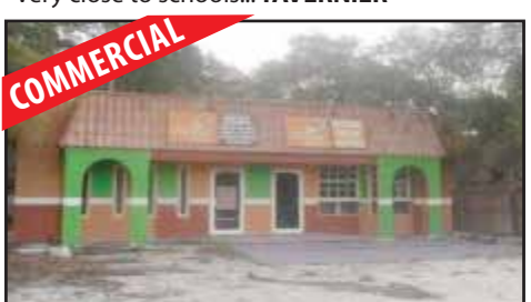
DRASTIC PRICE REDUCTION - 2 LEGAL SIDES IDEAL KEY LARGO LOCATION - GOOD VISIBILITY GOOD HIGHWAY FRONTAGE - MUST SELL NOW!!