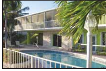
OWN YOUR OWN KEYS POOL HOME THIS SUMMER! Several great pool homes to choose from. Great for family fun and entertaining. Call to make an appointment