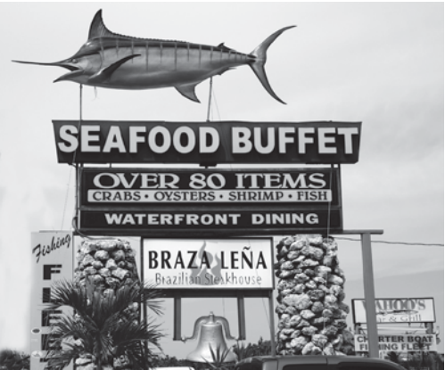
Construction removed the last of the old Whale Harbor last month. Farewell and fond memories!