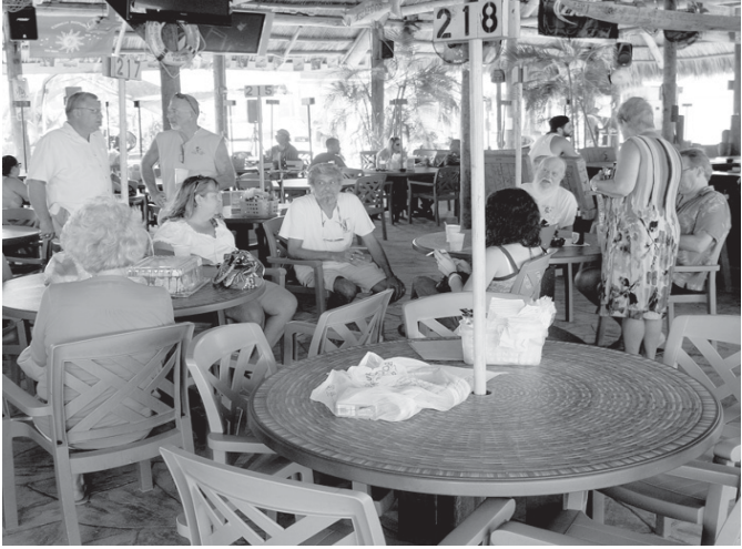
Pirates on the Water get together at Gilbert's for Happy Hour.