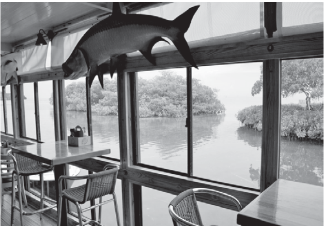
Breathtaking view from the Island Grill in Islamorada.