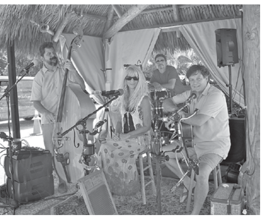
Sweetwater at Snooks Bavside