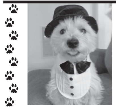
"I have 'Champagne taste on a Beer Budget'. I love Key Largo Pet Sitter and being treated like Royalty".