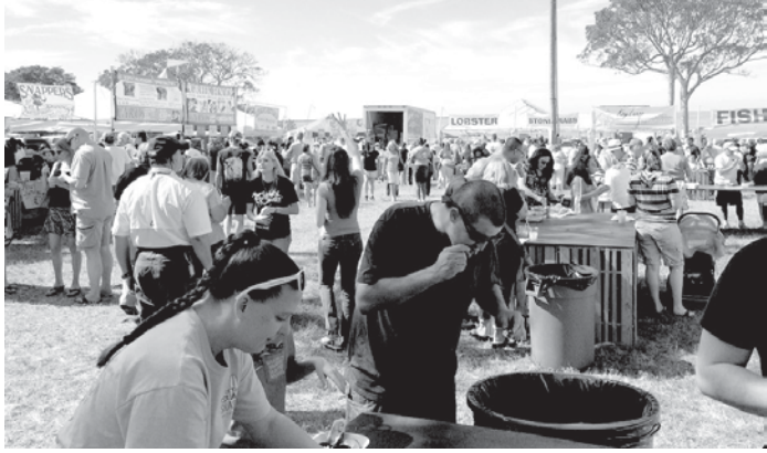
The Seafood Festival was successful and fun!