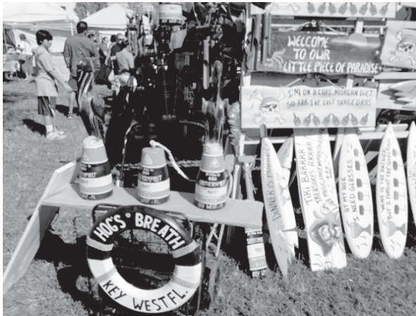
One of many unique vendor booths at the Seafood Festival.