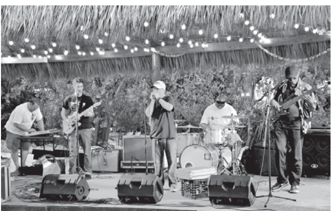
The Rockin' Jake Band thrills the audience at Bayside Grille.