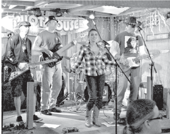
Cat Daddys rocking the Pilot House.