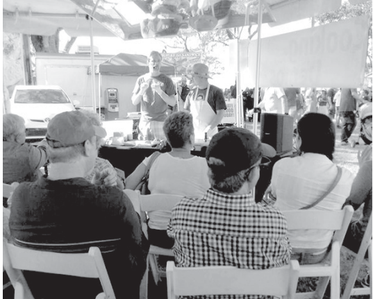
Key Largo Conch House demonstrates delicious seafood preparation at the Seafood Festival.