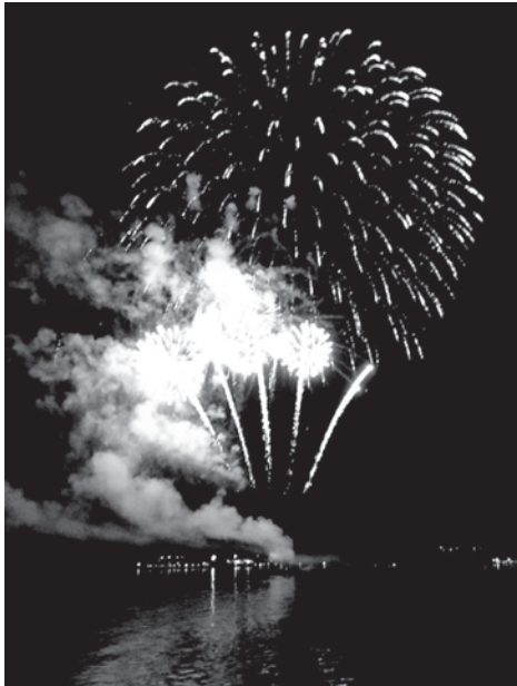
Island Time Cruise had a great view of the of Seafood Festival's fireworks.