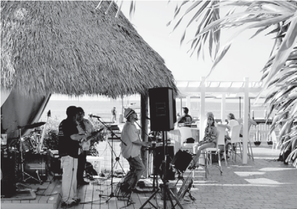
Gypsy Road Band entertaining the happy hour crowd at Snook's Bayside.