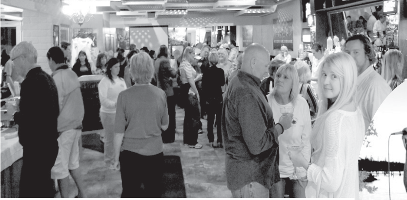
Chillin' at the Big Chill.