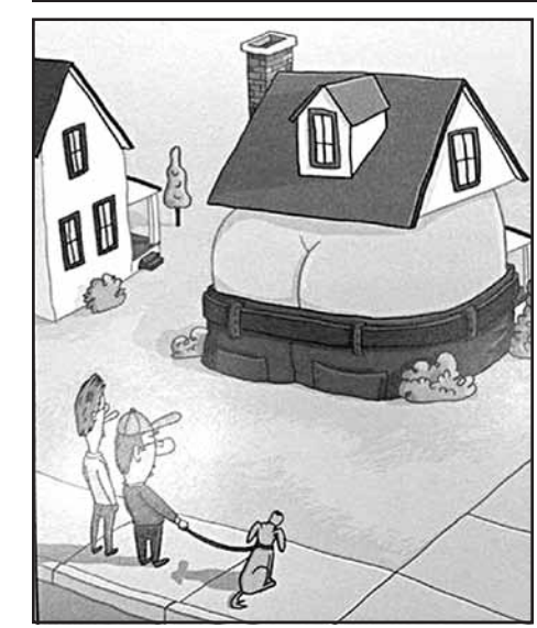
"This used to be a really good neighborhood until that crack house ruined everything."

Issued by BureauOfCommunication.com - Printed by the Coconut Telegraph in Key Largo