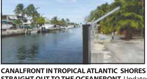
CANALFRONT IN TROPICAL ATLANTIC SHORES STRAIGHT OUT TO THE OCEANFRONT. Updated kitchen. 2 bdrm up and an apartment down, plus workshop. Porches on street side and canal side. Concrete roof. Beautifully landscaped. Fenced. Very close to schools... TAVERNIER