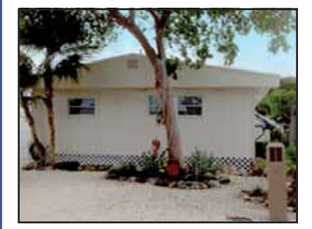
BEAUTIFUL MOBILE HOME ON A CANAL Well maintained, decorator perfect, great for full time or weekending. You won't find one nicer!! OWNER SAYS SELL!!

WE USE A PROFESSIONAL, LOCAL PHOTOGRAPHER WHO CAPTURES THE ESSENCE OF YOUR PROPERTY FOR BEST SALES RESULTS.