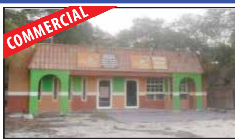
DRASTIC PRICE REDUCTION - 2 LEGAL SIDES IDEAL KEY LARGO LOCATION - GOOD VISIBILITY GOOD HIGHWAY FRONTAGE - MUST SELL NOW!!