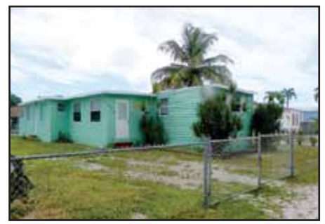
OWNER FINANCING - CANAL FRONT MOBILE Fenced - updated - plenty of room for parking