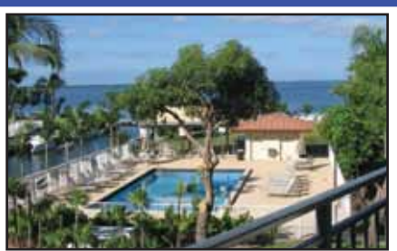
DRASTIC PRICE REDUCTION ON TAMARIND BAY UNIT 2/2 with bay views, and nice upgrades. Must sell NOW - good rental history.

www. creeksidetiki.com www.facebook.com/creeksidetiki