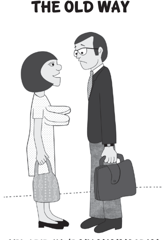
YES, I DID HAVE MY MAMMOGRAM TODAY... WHY DO YOU ASK?