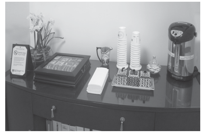
Nicely appointed with coffee, tea and amenities

For info on government healthcare call Dixie Hummlestein 305-240-9222 or 305-853-8975.