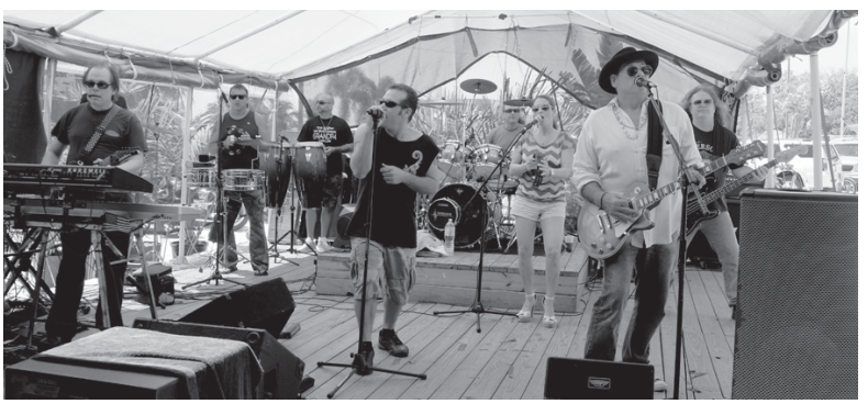
Always a great band at Gilbert's - this is Eclipse.