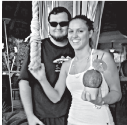
Every night at sunset a lucky person gets to pull the Sunset Horn... for a free chilled drilled & filled rum coconut at Snook's.