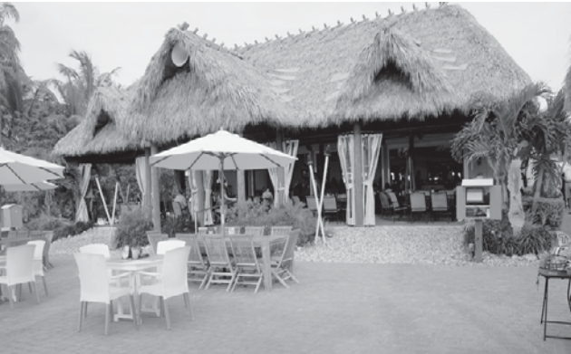
Snooks Bayside, lookin' good.