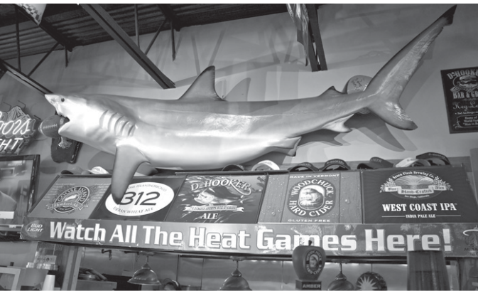
A friend of Katharine the Great White Shark was spotted hanging out at D-Hookers.