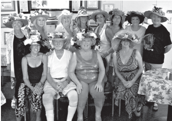
Tavernier Elks Lodge Kentucky Derby Party.