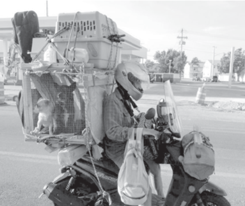
How to travel the Keys on a scooter with 2 cats and 2 dogs.