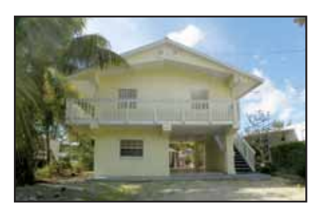
CANAL FRONT KEY LARGO HOME. Direct access to the bay. 2 bedrooms up. Workshop and storage down. $489,000.

We have cash investment buyers looking for properties in Key Largo... ready to buy!