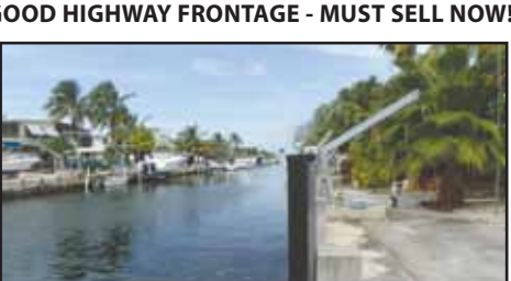
CANALFRONT IN TROPICAL ATLANTIC SHORES - STRAIGHT OUT TO THE OCEANFRONT. Updated kitchen. 2 bdrm up and an apartment down, plus workshop. Porches on street side and canal side. Concrete roof. Beautifully landscaped. Fenced. Very close to schools... TAVERNIER