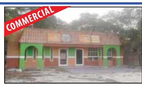
DRASTIC PRICE REDUCTION - 2 LEGAL SIDES IDEAL KEY LARGO LOCATION - GOOD VISIBILITY GOOD HIGHWAY FRONTAGE - MUST SELL NOW!!