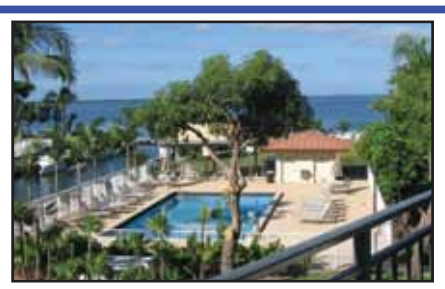
DRASTIC PRICE REDUCTION ON TAMARIND BAY UNIT 2/2 with bay views, and nice upgrades. Must sell NOW - good rental history.

www.creeksidetiki.com • www.facebook.com/creeksidetiki 107690 Overseas Highway Key Largo, Florida 33037 • 305-396-7353