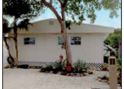
BEAUTIFUL MOBILE HOME ON A CANAL Well maintained, decorator perfect, great for full time or weekending. You won't find one nicer!! OWNER SAYS SELL!!