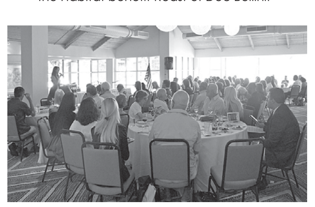
A packed house for the BPW'S candidate's forum!