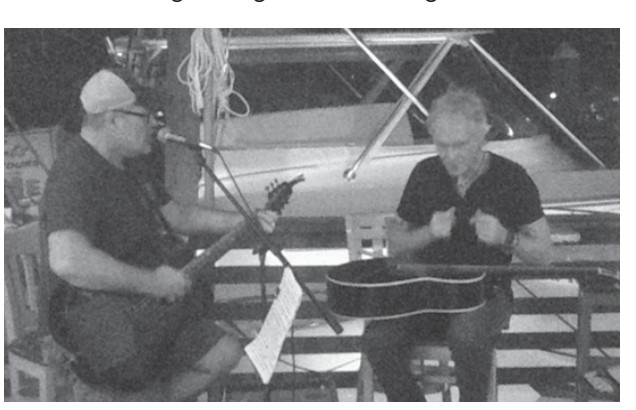
Downtown Key Largo Songfest at the Pilot House.