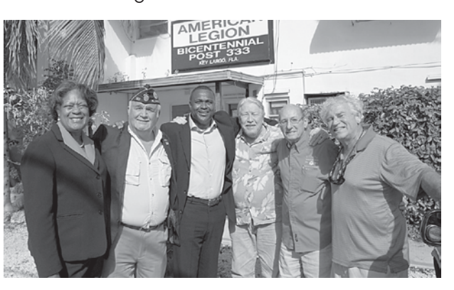
American Legion dignitaries visiting local officers.