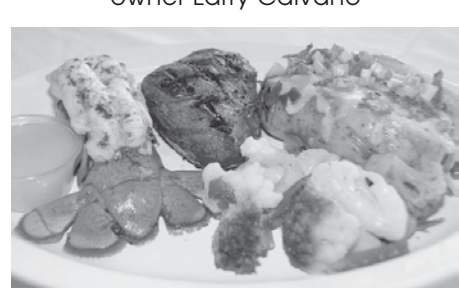
Did you try Gilbert's filet and lobster special Tuesdays and Wednesdays in October? Only $9.99 - delicious!