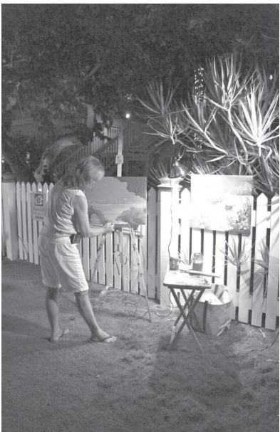
See artists in action.

Artists interested in registering for a booth at a Third Thursday ArtWalk please register at MoradaWay.org