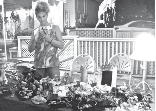
Jewelry, high quality gifts, and more.