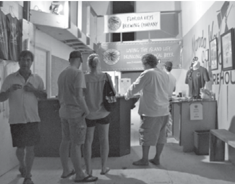
Locally brewed beer - free samples!