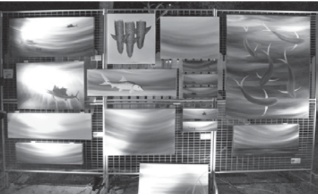
Amazing works of art.