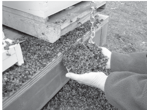
Thousands of dead honey bees.

professional will tell you that prevention is much more desirable than treatment. "Monroe County is at a crossroads with the way we handle our mosquito control and. We need to start implementing some newer technologies as they become available. Doing so will enable us to attack our mosquito problem more cost effectively, more environmentally friendly, and with a greater degree of success."