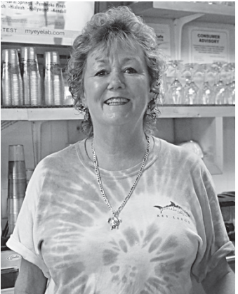
Kitty at the Galley recommends the quesadilla, it is the best in town!