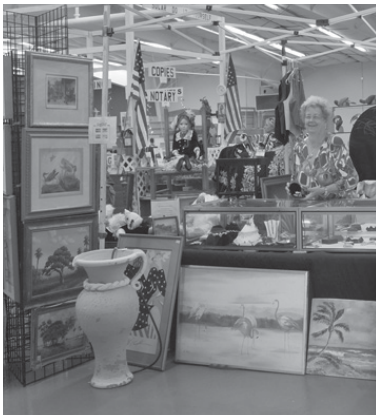
Dot's Antiques at Island Market.