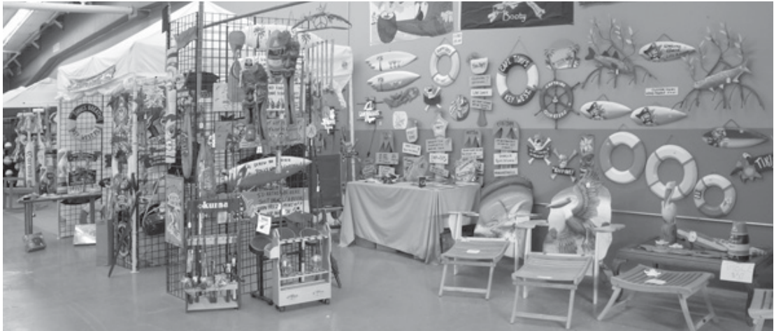
The new Island Market behind Dollar Tree has everything you need.