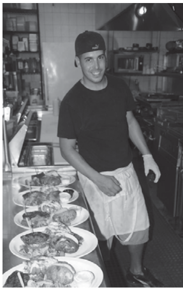
Gilbert's chef preparing filet and lobster dinners.