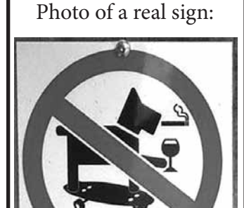
No smoking party dogs on skateboards allowed?