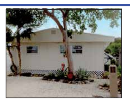
BEAUTIFUL MOBILE HOME ON A CANAL Well maintained, decorator perfect, great for full time or weekending. You won't find one nicer!! OWNER SAYS SELL!!

www. creeksidetiki.com www.facebook.com/creeksidetiki