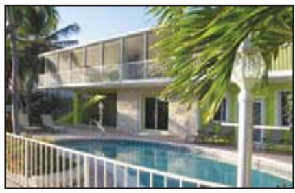
OWN YOUR OWN KEYS POOL HOME! Several great pool homes to choose from. Great for family fun and entertaining. Call to make an appointment