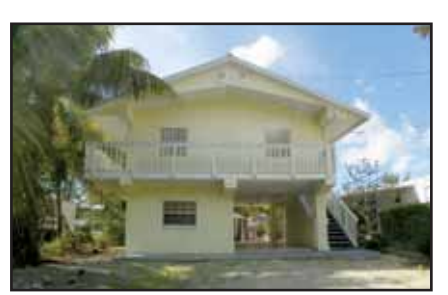
CANAL FRONT KEY LARGO HOME. Direct access to the bay. 2 bedrooms up. Workshop and storage down. $489,000.

We have cash investment buyers looking for properties in Key Largo... ready to buy!