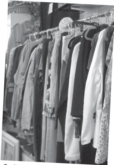
Both stores offer gently used designer fashions.