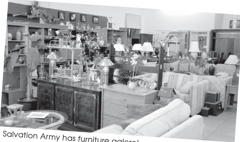
Salvation Army has furniture galore!