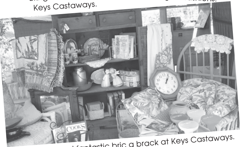
Fun, funky and fantastic bric a brack at Keys Castaways.