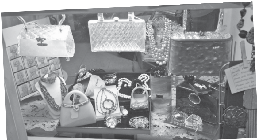
Coveted vintage lucite purses at Keys Castaways.