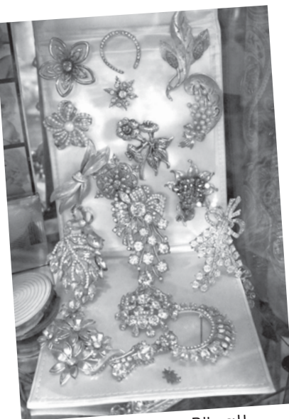
Bring on the Bling!! Keys Castaways.