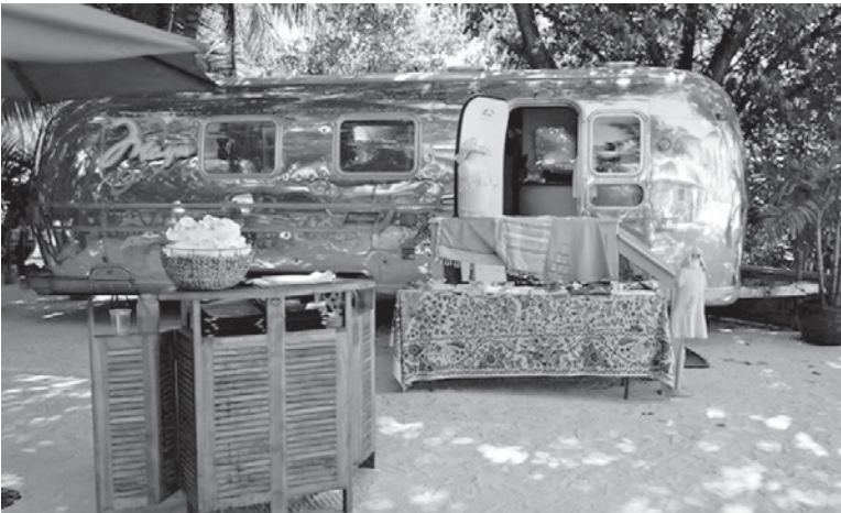
Check out the Morada Bay Cafe Gift Shop. It is an old Airstream, converted