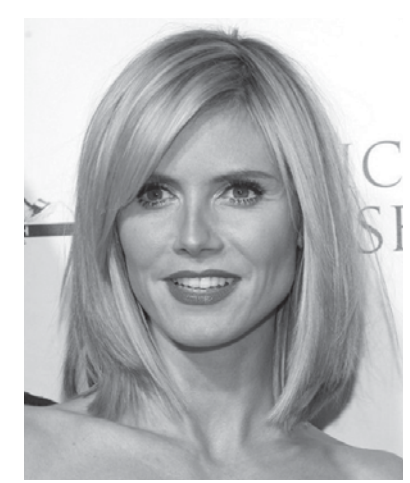
how can you go wrong?

Need hair tips and advice? Write us at upyourhair @gmail.com, we would love to hear from you. Thank you and have a beautiful day!