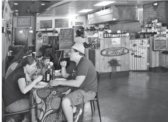
Are you health conscious but your spouse craves good home cooking? The Mindful Mermaid is delicious and delightful! Next to Publix. Never go grocery shopping on an empty stomach!