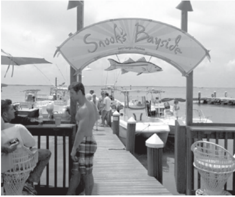
Always a great view at Snooks!