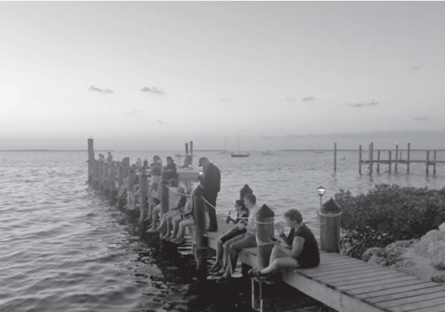
Celebrating sunset at Bayside Grill.