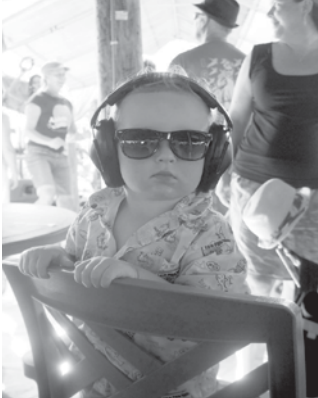
Cool kid with smart parents enjoys the live music at Gilberts.