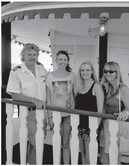
Family night on Island Time Cruise.