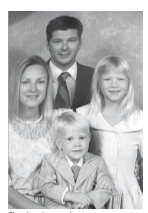
The family...early days.

Anyone who would like to contribute may still do so at www.gofundme.com/yd4v9e4c