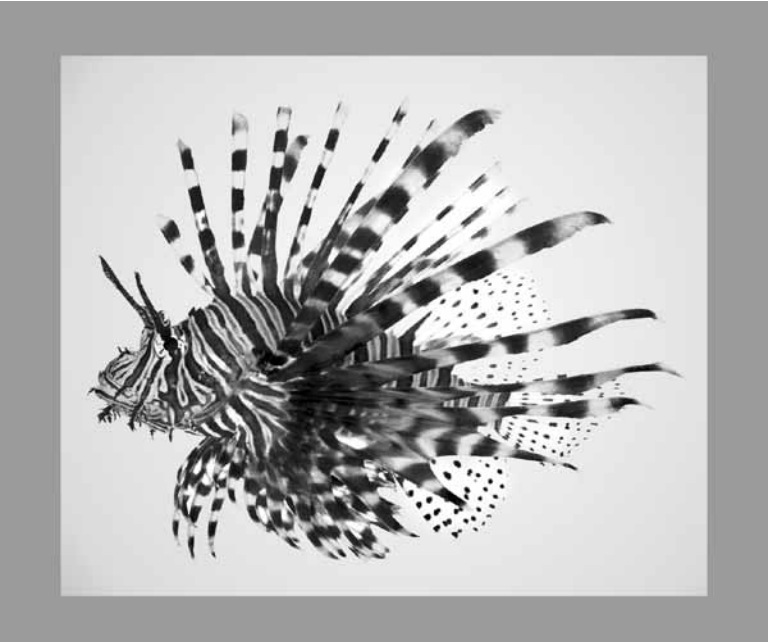
Why don't we have a Lionfish mini season instead?