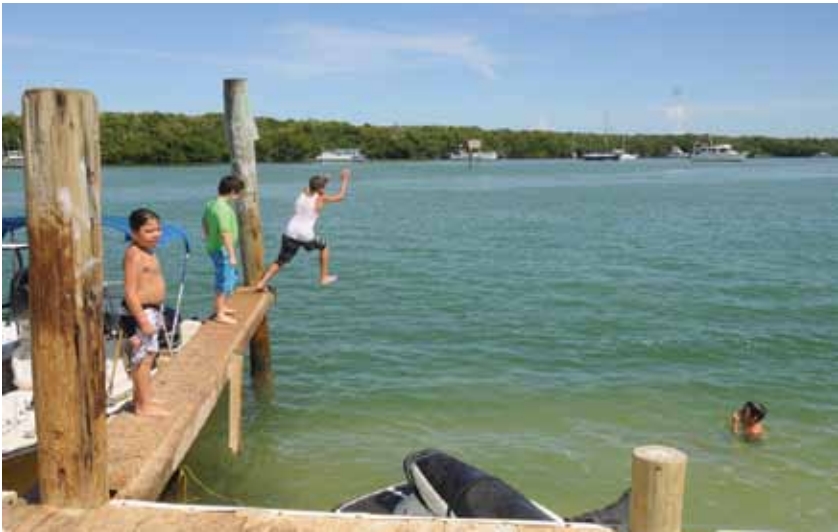
Gravity always wins! Gilberts Resort dock near the beach by Rob LeBrun.