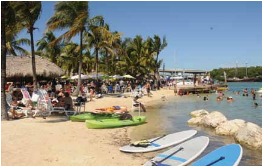
Plenty to do at Gilberts Resort!