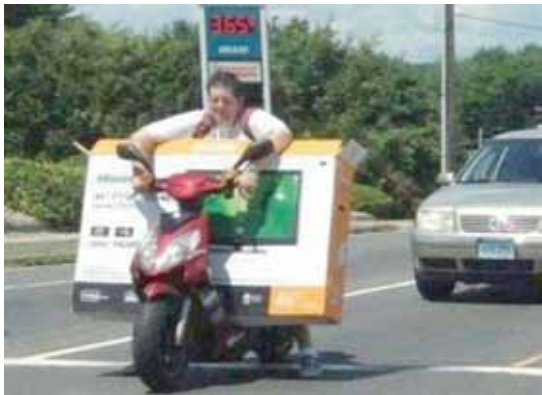
As if US1 wasn't scary enough!