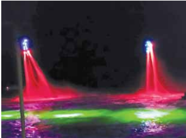
Lava light show at theBig Chill on the 4th of July.