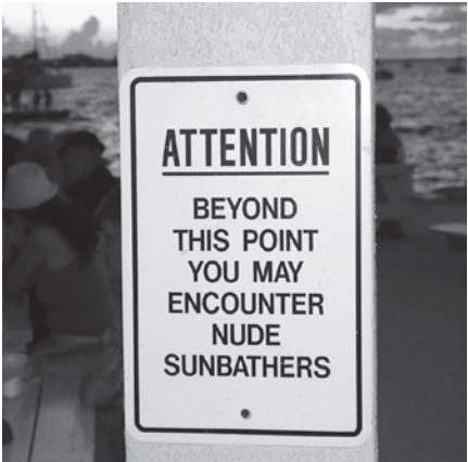
This sign can be spotted at Bayside Grille on the beach!