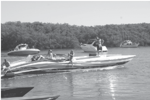
Power Boat Races at Gilbert's.