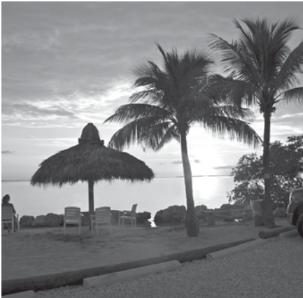
Sunset at Gilbert's.