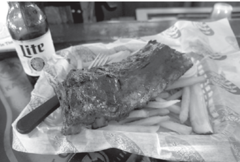
Country Music Night - first Friday of the month at Gilbert's. And every Friday they serve a fantastic rib dinner including a beer for only $9.99.