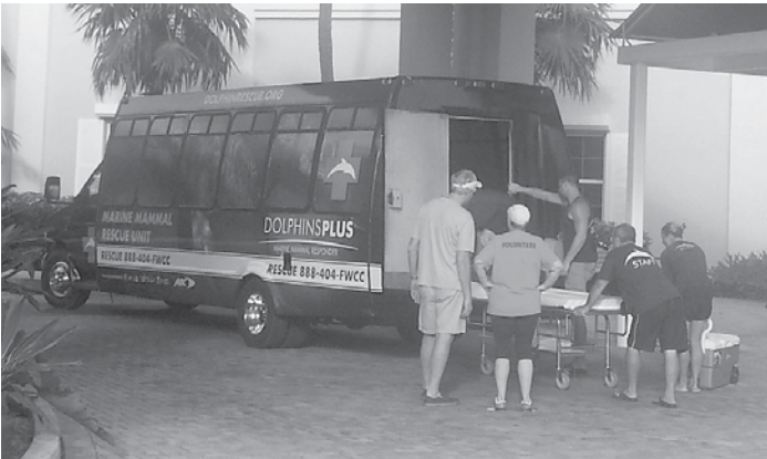
Things you ONLY see in the FLORIDA KEYS. I was leaving the Mariners Hospital gym early Sunday AM when I saw this scene in front of the hospital. They had just done a CT scan on a sick dolphin and it was going back to Dolphins Plus. One of the hospital staff said to me, "They are part of our community too." I do love my hospital.