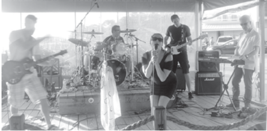
New band Rock Candy at Gilbert's Resort.