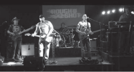
Gilberts will have a special Country Night on January 1st featuring Rough Shot from Ft. Lauderdale. Also appearing from 7-9pm are the guys from Thunder Country to give away tickets to the SOLD-OUT Garth Brooks concert in mid-January.