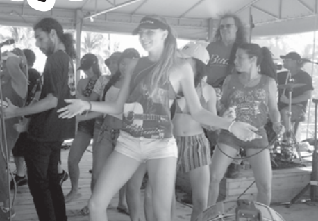
Sounds Eclipse Band Live were rockin' the Gilbert's stage so much, that fans joined them to dance.