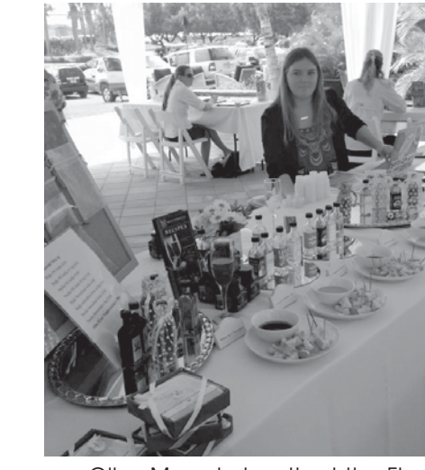
Wedding Showcase at the Islander Resort in Islamorada.