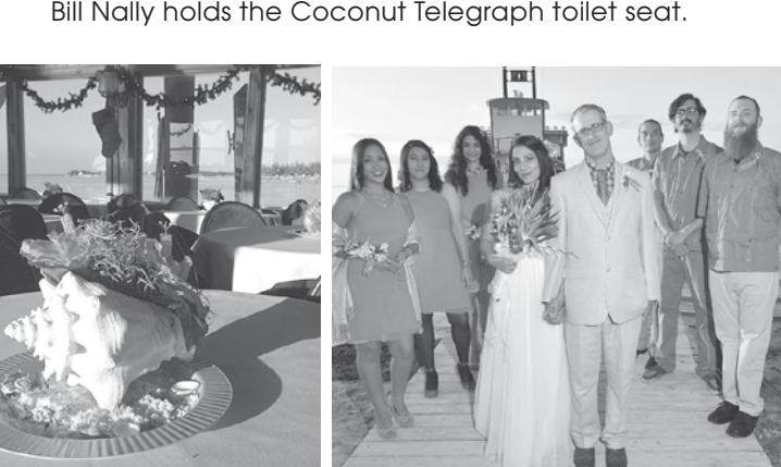
Fabulous weddings aboard Island Time Cruises