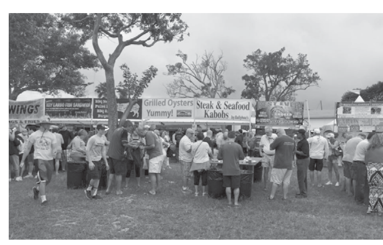
Key Largo Merchant's Stone Crab & Seafood Festival -another huge success!