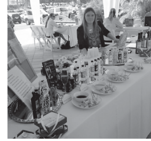
Olive Morada booth at the Florida