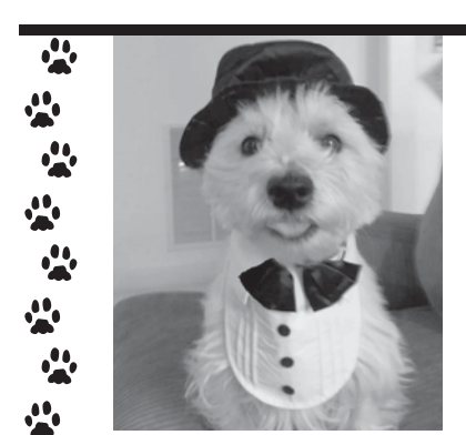
"I have 'Champagne taste on a Beer Budget'. I love Key Largo Pet Sitter and being treated like Royalty". Cody P.

Every Day 4 to 6pm featuring... $1 Drafts Pitcher and Wings Special • Beef or Chicken Sliders OPEN 11 AM to 10 PM EVERY DAY